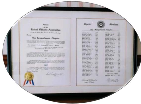
Susquehanna Chapter original charter dated October 1969