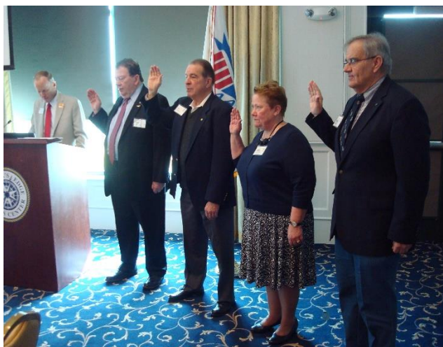
Installation of new officers for CY 2019