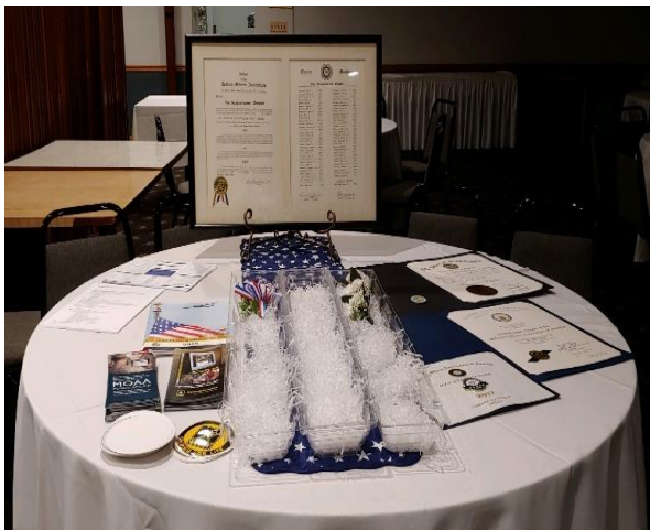
The Chapter "Homecoming" table, complete with corsages and boutonnieres for members and guests.