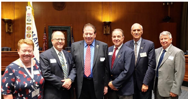
Six of the eight Chapter members who attended the Maryland MOAA Congressional luncheon in 2019

The month of September began with eight members attending the Maryland Congressional Luncheon in a show of support for the local, state and national MOAA initiatives.