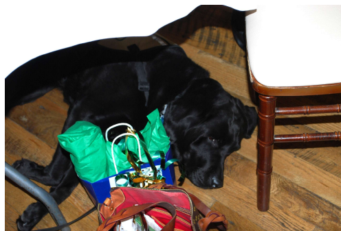
"PJ" on duty