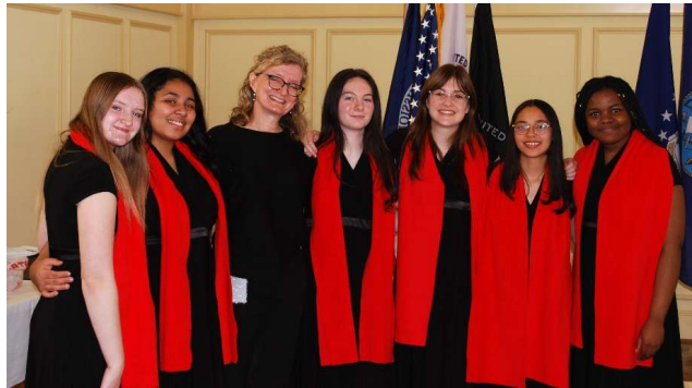
Members of the Barbara Ingram School of the Arts choral group provided our entertainment