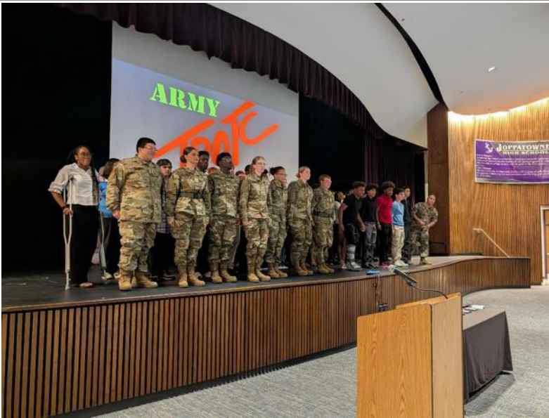
Joppa High JROTC Cadets receive awards 3 June