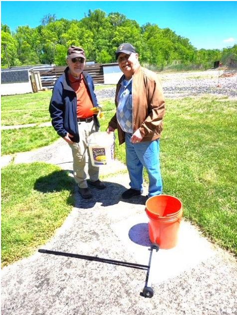
Picking up the brass