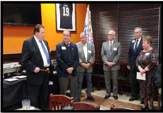
Susquehanna Chapter newly installed officers for 2020